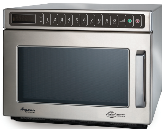
Model HDC12A2 shown