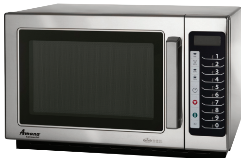
Model RCS10TS shown