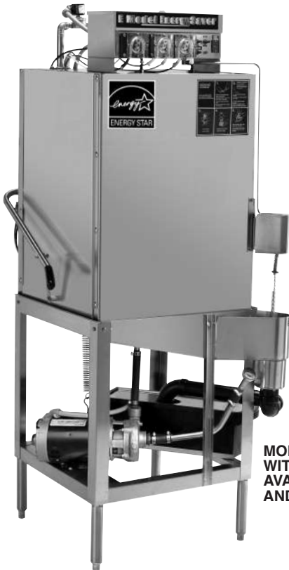
MODEL E EXT WITH 20-1/2" DOOR OPENING AVAILABLE IN STRAIGHT AND CORNER MODEL