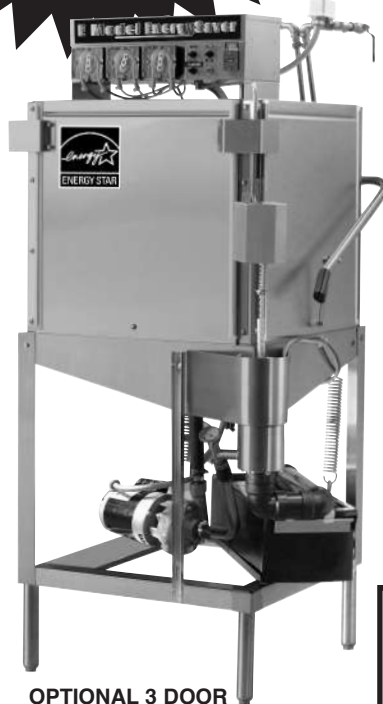
OPTIONAL 3 DOOR MODEL AVAILABLE FOR STRAIGHT AND CORNER OPERATION