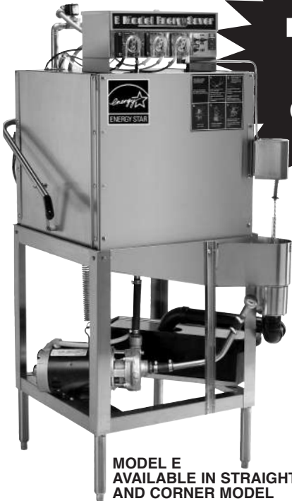
MODEL E AVAILABLE IN STRAIGHT AND CORNER MODEL

USES ONLY 1.01 Gallons Of Water Per Cycle!