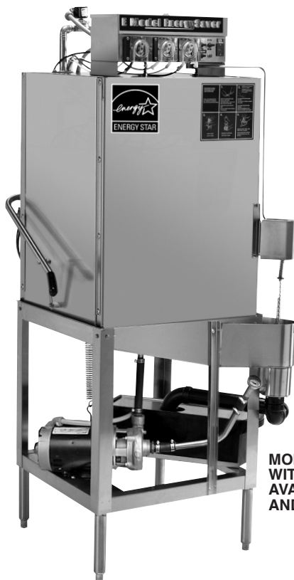
MODEL E EXT WITH 20-1/2" DOOR OPENING AVAILABLE IN STRAIGHT AND CORNER MODEL