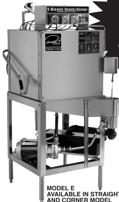
MODEL E AVAILABLE IN STRAIGHT AND CORNER MODEL

USES ONLY .93 Gallons Of Water Per Cycle!