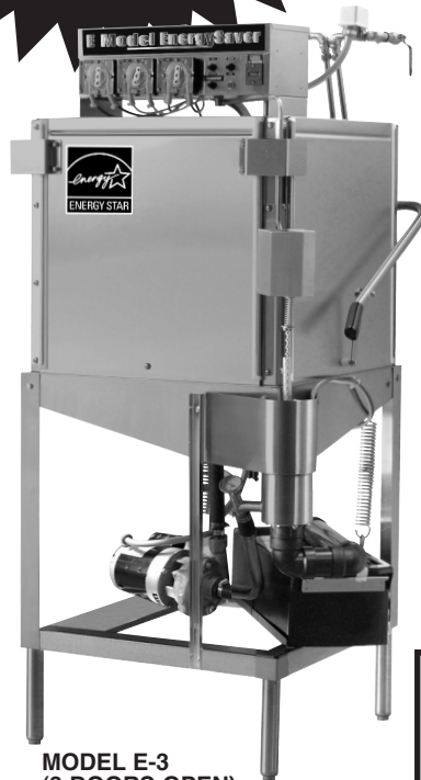
MODEL E-3 (3 DOORS OPEN) AVAILABLE FOR STRAIGHT THROUGH AND CORNER OPERATION.