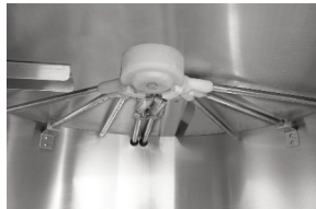
Independent spray arms blast water from the top and bottom for optimum cleaning, sanitizing and rinsing.