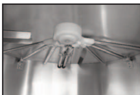
Independent spray arms blast water from the top and bottom for optimum cleaning, sanitizing and rinsing.