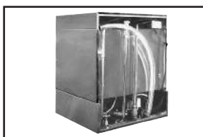
Pumped drain will drain uphill. Requires no floor drain.