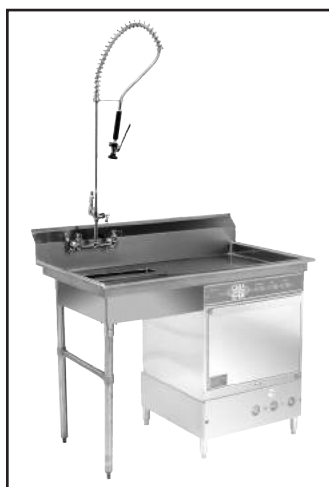
Optional dishtable and faucet.