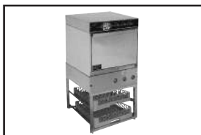
The optional Universal Pedestal has a storage feature for spare dishracks, with the ability to store two empty dishracks beneath the machine. 15-1/4"H X 24"W X 25-1/4"D.