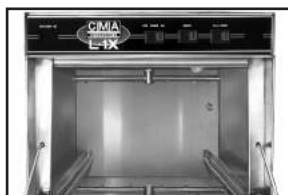
Upper and lower rotating wash arms guarantee excellent results.