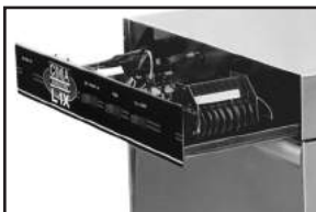
"Work-in-a-drawer", may be removed.