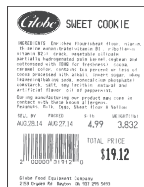
Ingredient Label (E13) Actual size: (2.3" x 3.35")