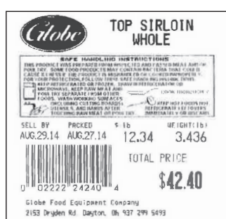
Safe Handling Label (E12) Actual size: (2.3" x 2.3")