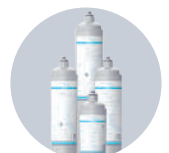
Arctic Pure Water Filters