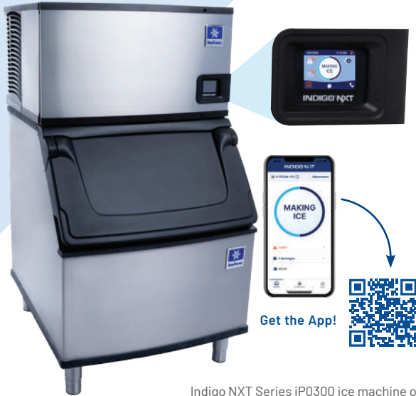
Indigo NXT Series iP0300 ice machine on D400 bin. Ice machine and bin sold separately.