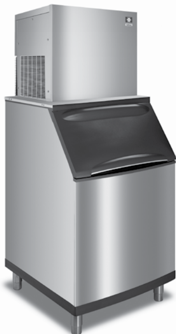
Model RF0300A Flake Ice Machine on B-570 Bin