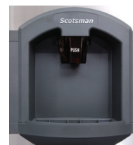
Easy Push Chute