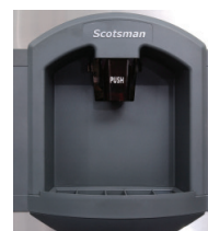
Easy Push Chute