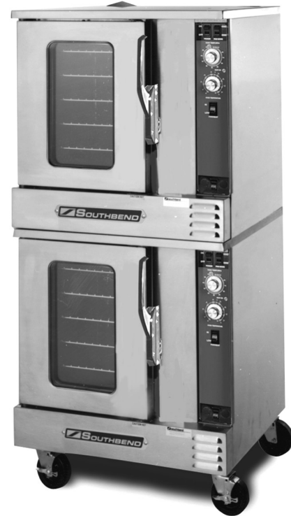
(shown with optional casters)

150°F to 500°F temperature controller with 140°F to 200°F "Hold" thermostat. Dual digital display shows time and temperature. A fan cycle timer pulses the fan.