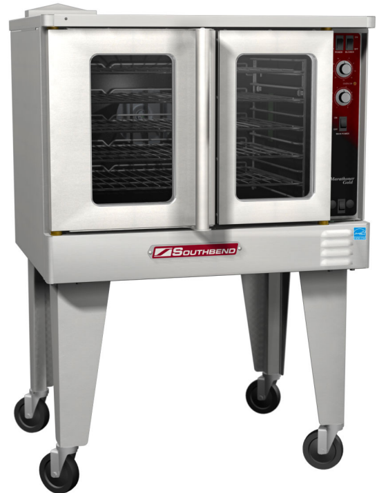
(GS/15SC shown with optional casters)