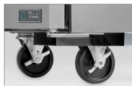
Standard 5" Castors