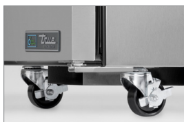
ADA 3" Castors