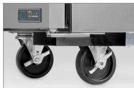
Standard 5" Castors