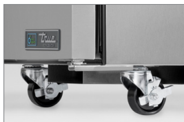
ADA 3" Castors