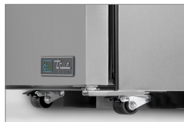
Low Profile (LP) 1½" Castors Upcharge applies for (LP) size castors