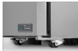
Low Profile (LP) 1½" Castors Upcharge applies for (LP) size castors